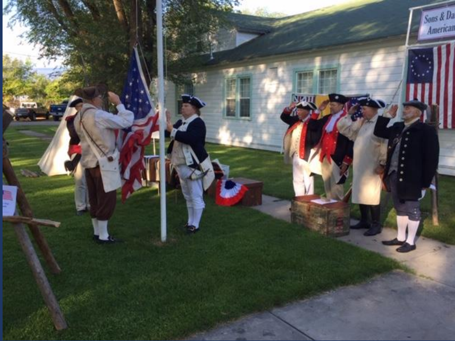
Compatriots of the Liberty Tree Chapter stand at attention as the American Flag is raised to start the July 4 th Celebration.