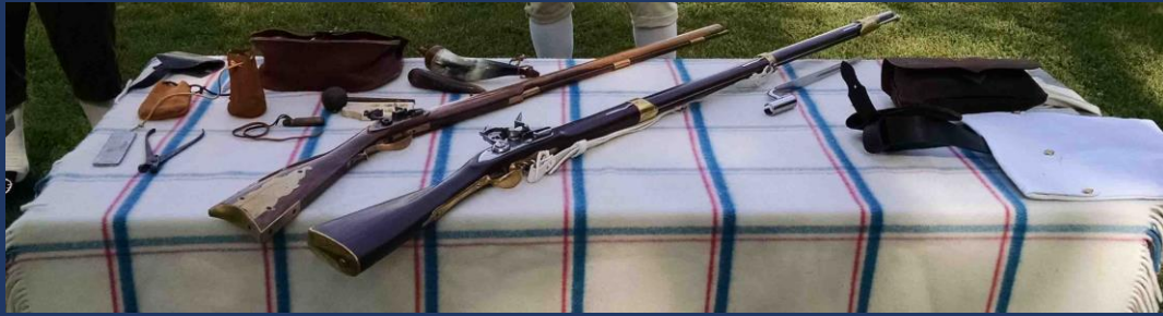
Revolutionary War Replica weapons and the necessary equipment for a Colonial Soldier on display.