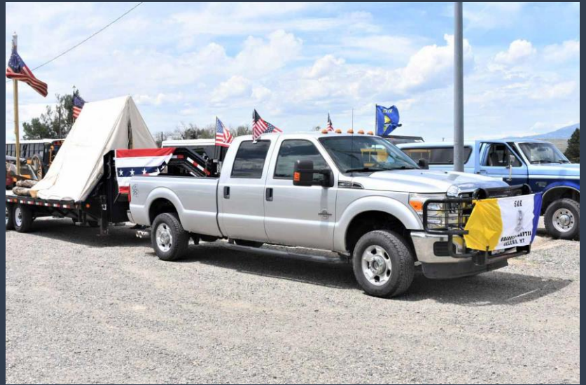
Don Reeds' pickup ready and outfitted to start the parade.