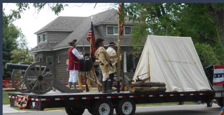
Everyone is enjoying the ride and having fun.