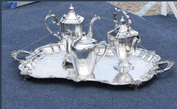
Donated Tea Service