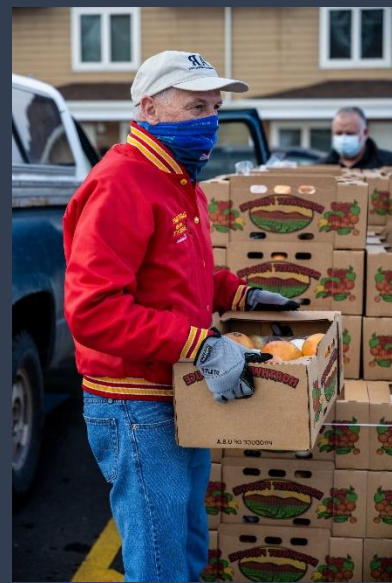
Composite picture of the Volunteers